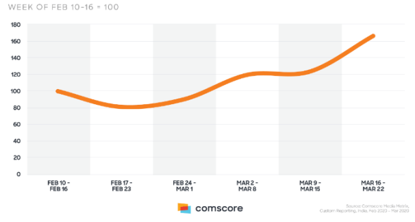
Figure 2: The business and financial site visit index

As per Fig 2, Amid the pandemic's impact on financial markets, there has been a remarkable surge in the reach and engagement with digital content in the "Business News" category. Between the weeks of March 9-15, 2020, and March 16-22, 2020, the number of unique