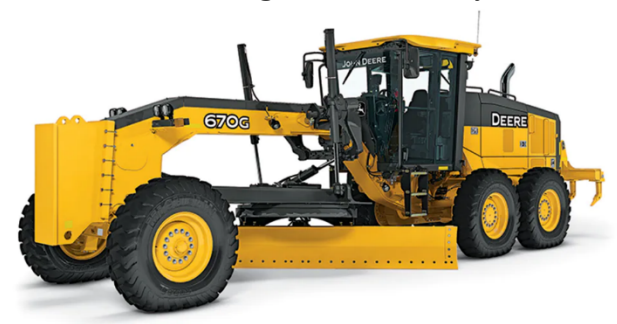
Patrol/Motor Grader – Model 670G

The productivity of the forest management project relies heavily on the utilization of mechanized patrols, which comprise various heavy machinery. The motor grader, also known as a patrol, is employed to clear logging trails, while crawler tractors are used for opening new trails and paths. Skidders, which are articulated forestry tractors, are responsible for dragging the logs to the designated yard, and the front-end loader is used to load trucks with the cleared logs. Moreover, the wheel loader is frequently employed to pull trucks out of muddy areas, ensuring efficient transportation. Figure 3 below provides an illustration of the forestry machines utilized in the wood extraction operation.