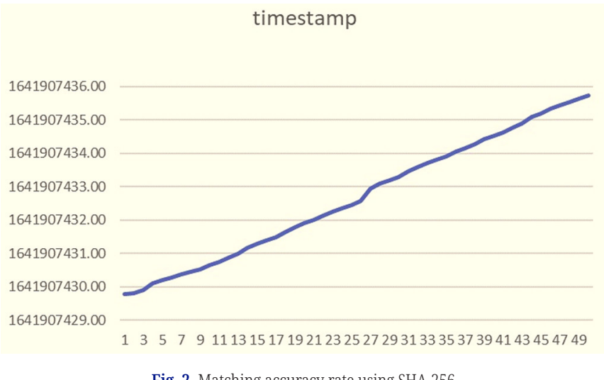
Fig. 2. Matching accuracy rate using SHA-256

In accordance with the sampled implementation, the two tests demonstrate that the hash and previous hash values are congruent, signifying that the SHA256 hashing method functions effectively for encryption processes and maintains interconnectivity among blocks [2] [3]. The validity of these values can be observed from the results of the trial conducted on each block, as the data from every resource undergoes mobility. We will include the data from 20 test samples employing the SHA-256 algorithm at the end of this paper. When represented graphically, as in Figure 2, it is evident that the rate of invalidity is remarkably minimal.