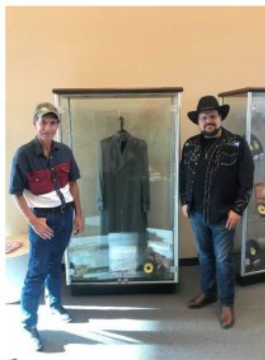
MCOB Library: MLRC Staff

Biomedical Library: Library Instruction Marx Library Instructional Services Program McCall Library: Faculty and Staff