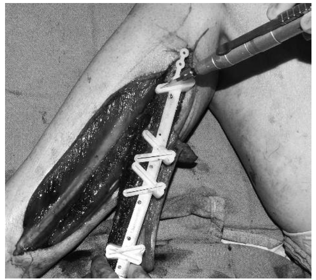
A surgeon uses a reciprocating saw to make osteotomies according to a plastic cutting guide placed on the patient's fibula. The cutting guide was created from a virtual plan for a fibula flap jaw reconstruction.

"We worked with a software design company to develop a modified version of computer-assisted design software, which is used in drafting and engineering, specifically for the craniofacial skeleton," Dr. Skoracki said. The software creates a virtual replica of the patient's anatomy from magnetic resonance imaging (MRI) or computed tomography (CT) images of the patient's jaw. The software helps surgeons to plan the reconstruction by creating the exact shape of the jaw that will be resected. The surgeons can then cut a virtual fibula to the exact angles that will