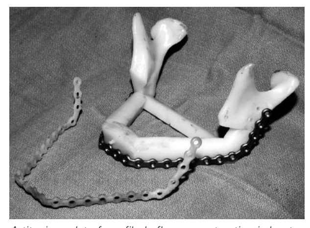
A titanium plate for a fibula flap reconstruction is bent preoperatively to match plastic models of the patient's mandible and of the plate itself.

optimize bone apposition, further helping plan the surgery.