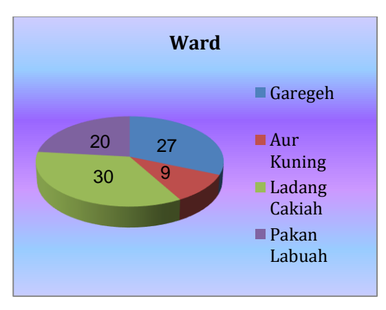
Figure 1 Family School participant data