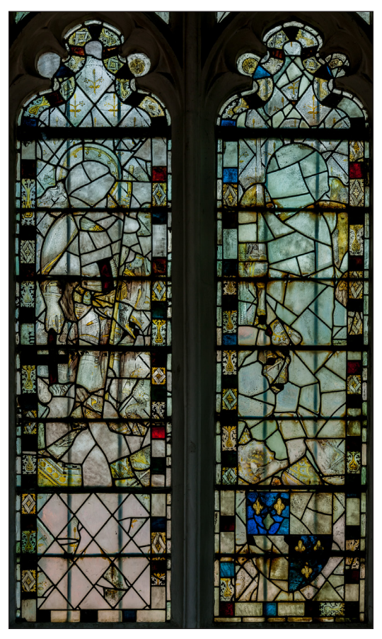
Fig. 6: North aisle (nIV), St John the Baptist, Thaxted (Essex). Fifteenth-century figures of St George and St Michael as restored by Charles Eamer Kempe. © Christopher Parkinson.

The prolific and well-known London company founded by Charles Eamer Kempe (1837–1907) undertook a small number of important restorations in which Winston's influence is equally clear. In the firm's 1906–07 restoration of fifteenth-century glass at St John the Baptist, Thaxted in Essex, a series of figures of saints in the north aisle were releaded.<sup>50</sup> Many lacunae were made good with plain unpainted glass inserts, predominantly white, to match the overwhelmingly monochrome palette of the medieval figures ( Fig. 6 ). While this ensures that the original glass can