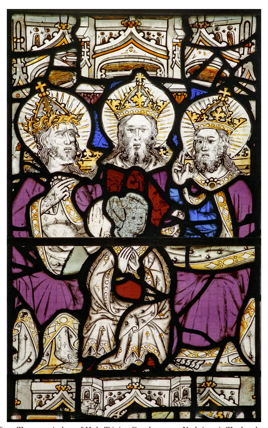
Fig. 1: The east window of Holy Trinity, Goodramgate, York (1472). The lost head of the seated Virgin May has been replaced, probably in the early nineteenth century, by the head of a female donor figure of similar date.