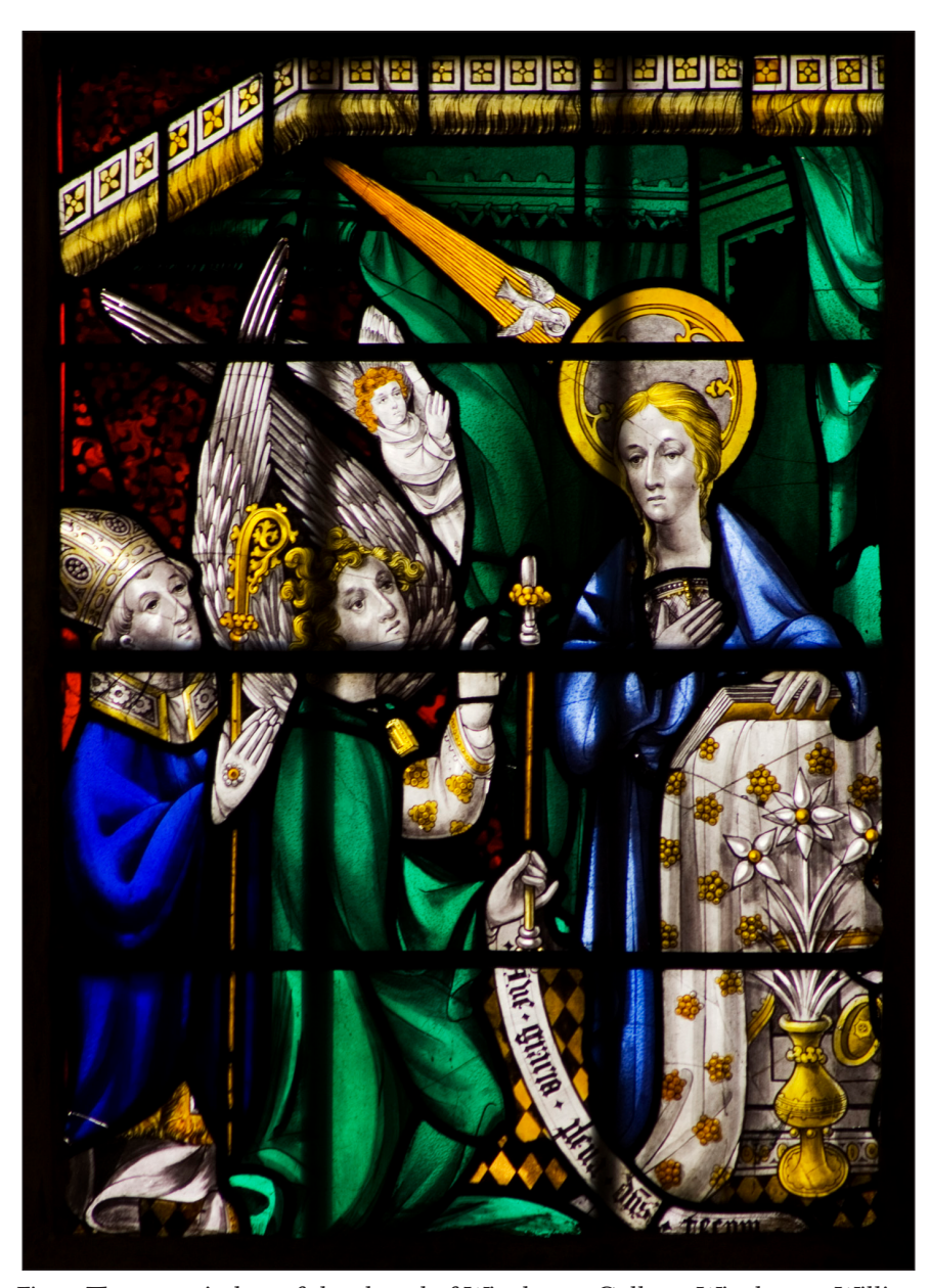
Fig. 2: The east window of the chapel of Winchester College, Winchester. William of Wykeham witnesses the Annunciation, a copy by Betton and Evans of an original panel of c. 1385.

It has been suggested that Betton and Evans hoodwinked the college into believing their old glass had returned, but it is more likely that their clients simply shared the widely held early nineteenth-century view that accurate