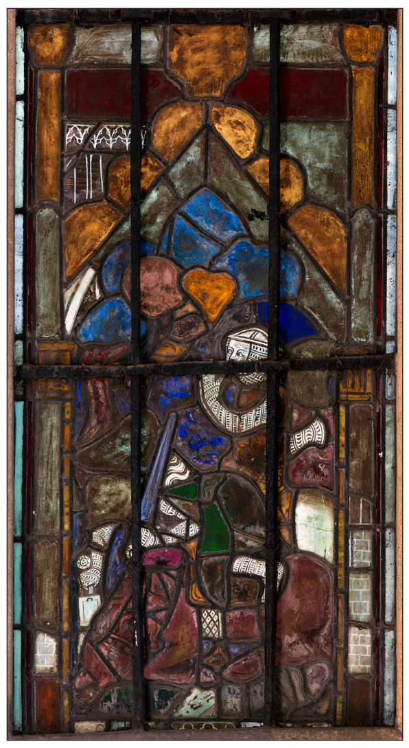
Fig. 5: The conversion of St Paul in the east window of the Stapleton Chantry at All Saints, North Moreton (Berkshire) following restoration by Ward and Hughes, photographed in 2018.

other imperfections, albeit without indicating this distinction in his drawings.<sup>47</sup> This is the case, for example, in his pre-restoration record of the glass at North Moreton, for which he launched a public restoration appeal around 1856. Winston's watercolours show far more detail in the canopies than now survives in the medieval glass ( Fig. 5), suggesting that Ward and