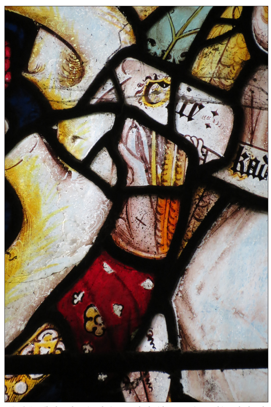
Fig. 8: Detail of newly painted piece, marked with a cross, inserted into the hand of Jesse by Westlake.