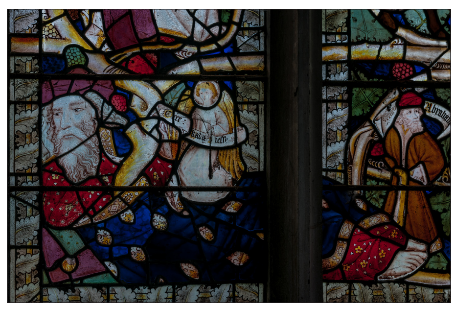
Fig. 7: East window of St Margaret, Margaretting (Essex). Reclining figures of Jesse, as restored by N. H. J. Westlake.

medieval models derived from the window itself, justified by the fact that the medieval designer had already repeated a number of his own cartoons. Westlake also ensured that any new addition to an old figure be easily recognized by the addition of a clearly distinguishable cross in fired glass paint ( Fig. 8 ). This is the earliest example known to me of what is now a common requirement in modern stained glass conservation.<sup>54</sup> In this innovative and scholarly restoration, Westlake achieved a fine balance between the approach attributable to the influence of Winston and that of the Viollet-le-Duc philosophy of restoration. He achieved a harmonious and legible iconographic composition in a liturgically sensitive location, which also allows for an immediate distinction to be drawn between old and new, but without the negative aesthetic consequences of blank insertions. Not until Cesare Brandi's influential Theory of Restoration (1963) does one find a coherent rationale for aesthetic restoration of this kind.