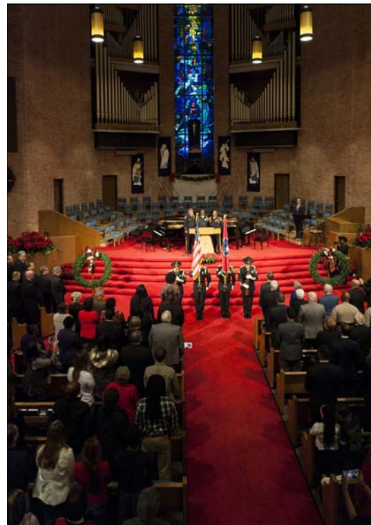
Tennessee Season to Remember - December, 2017.