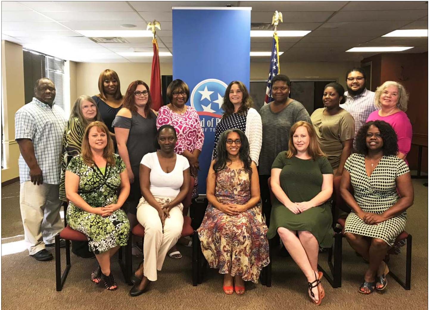
Board Operations staff enjoyed learning a variety of new information during their annual professional development event. Topics included public records requests, hearing procedures, parole eligibility, time set issues, TDOC programming, computer technology and self-development.