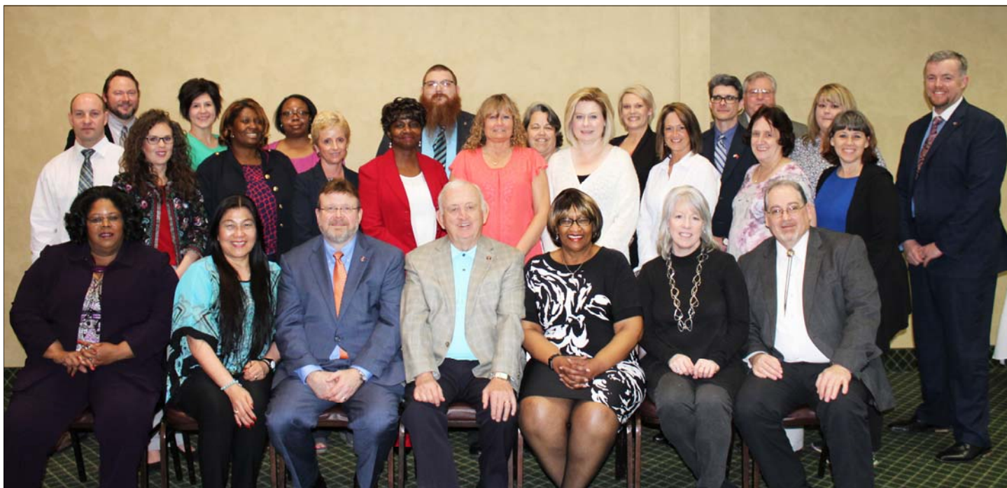
During the annual training for the Parole Hearings Division, staff attended sessions on various relevant topics, including legal training from the board's General Counsel, a presentation on the opioid crisis from the Knoxville Police Department, gang information, and parole hearing process training from the board's Hearings Management team. They attended additional training sessions presented by the board's Human Resources Director, Board Operations Director, the board's Information Systems Manager, and Department of Correction staff.