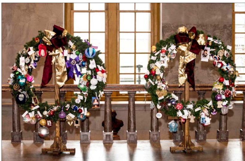
Tennessee Season to Remember wreaths on display in the State Capitol - December, 2017.

This was the eighth consecutive year that the Board of Parole has worked on this holiday memorial for families of homicide victims. The Tennessee Season to Remember was organized by the Board of Parole in cooperation with the Secretary of State's Office, the Department of Safety and Homeland Security, the Tennessee Bureau of Investigation, the Department of Correction, the Department of Finance and Administration's Office of Criminal Justice Programs, the Office of Attorney General and Reporter, the Tennessee District Attorneys General Conference and the Tennessee Rehabilitative Initiative in Correction (TRICOR).