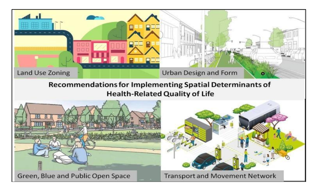
Figure 2: Recommendations for Implementing Spatial Determinants of Health-Related Quality of Life.