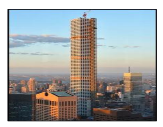
Figure 8: 432 Park Avenue, New York, USA [4].

mechanical floor, water damages were reported in many flats, the complaints included that high winds held one of the residents inside the elevator and caused 'creaking, banging and clicking noises', and residents have complained about the increase in the high annual costs of servicing a private restaurant. In addition to a 300 percent increase in insurance costs during a period of two years. It found that 73 percent of the building's mechanical, plumbing, or electrical infrastructure was not built according to the plans [22].