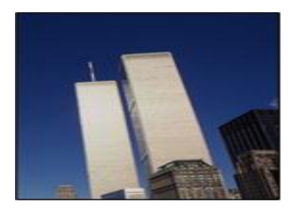
Figure 4: The Twin towers, New York, USA [2].