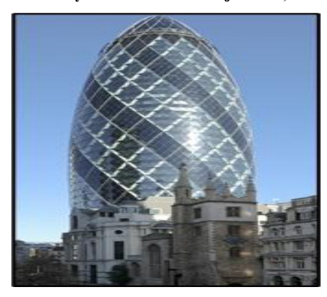
Figure 7: The Gherkin, London, England [20].