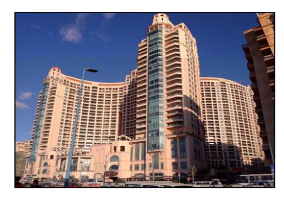
Figure 10: Taken by the researcher of San Stefano Grand Plaza, Alexandria, Egypt.

and it has not been affected by the erosion factors caused by its proximity to the sea.