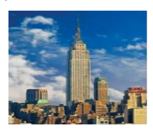
Figure 2: The Empire state building, New York, USA [28].