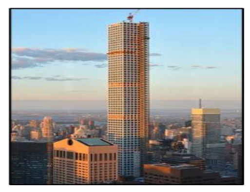
Figure 8: 432 Park Avenue, New York, USA [4].

mechanical floor, water damages were reported in many flats, the complaints included that high winds held one of the residents inside the elevator and caused 'creaking, banging and clicking noises', and residents have complained about the increase in the high annual costs of servicing a private restaurant. In addition to a 300 percent increase in insurance costs during a period of two years. It found that 73 percent of the building's mechanical, plumbing, or electrical infrastructure was not built according to the plans [22].