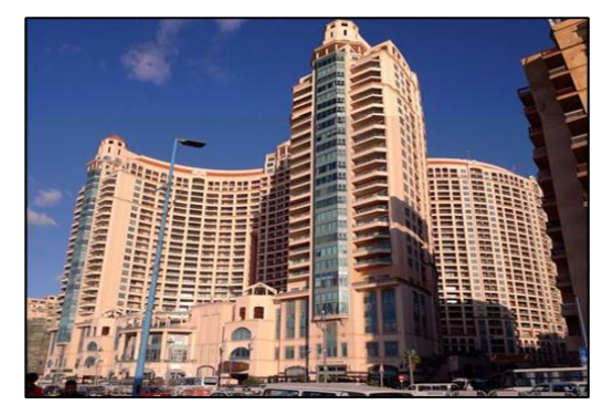
Figure 10: San Stefano Grand Plaza, Alexandria, Egypt.

and it has not been affected by the erosion factors caused by its proximity to the sea.