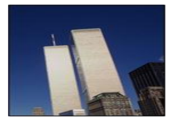
Figure 4: The Twin towers, New York, USA [2].