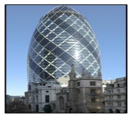
Figure 7: The Gherkin, London, England [20].