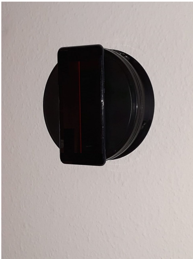
Fig. 2 SVV test

2–3 years, this delay should be compensated for and children should have the same abilities as those born at term [7, 16].