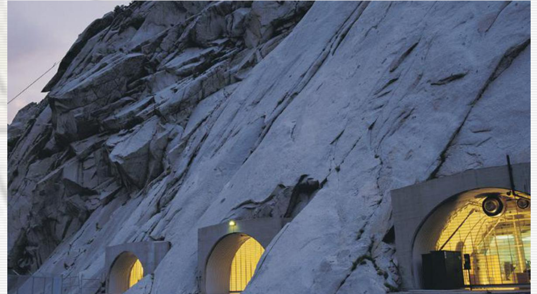
Granite Mountain Records Vault.