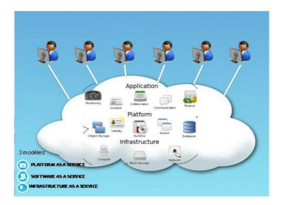
Figure 2: The 3 cloud computing models.

The cloud comes in the form of 3 offerings: SaaS, PaaS and IaaS (Figure 2) [12].