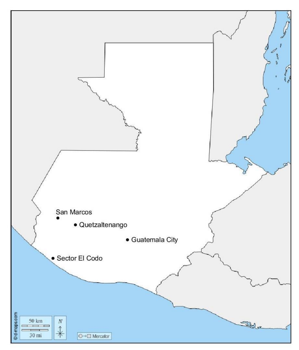
Map of Guatemala, featuring locations that are important to this thesis.