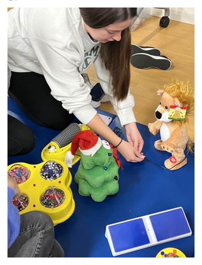
4 - Students interacting with assistive technology