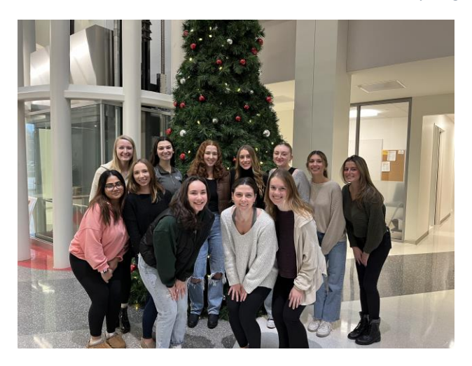
13 - New board members of SOTA and COTAD