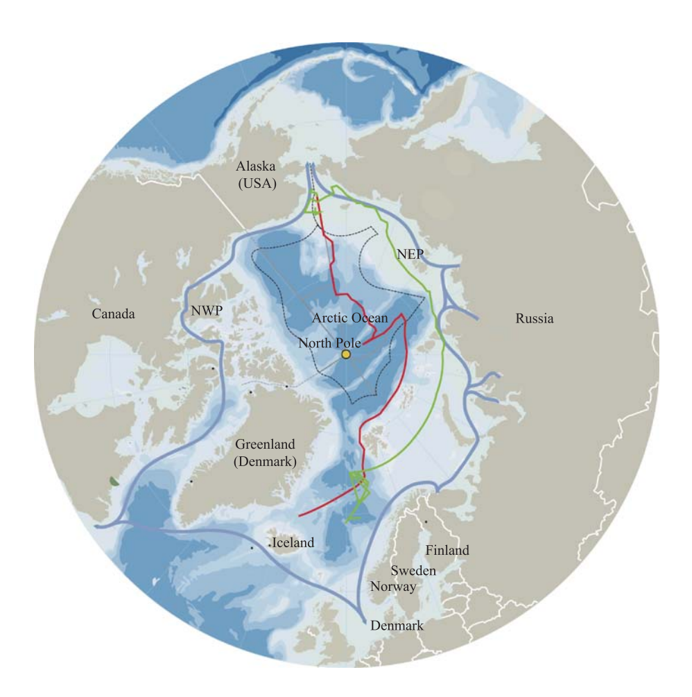
Figure 3 Arctic Ocean Route of the R/V XUE LONG icebreaker (or Snow Dragon), during its fifth Chinese Arctic Research Expedition. The green line indicates the outbound route on the Northeast Passage; the red line indicates the inbound route on the Central Passage; and the red dashed line denotes the boundary of the exclusive economic zone.

"heavy" ice conditions, ships like R/V XUE LONG icebreaker belonging to the Arc6 category will be granted independent navigation. Ships belonging to this category and above (the Chinese icebreaker currently being built is of PC3 quality, equivalent to Arc7) will be granted independent navigation under any ice conditions from July to November, even in light ice conditions in winter. Moreover, the waiting time for the granting of permission has also been shortened from at least 4 months prescribed in the 1991 Regulations to 25 working days in the 2013 Rules. With publicity provided through the internet, the approval procedure will also be more transparent.