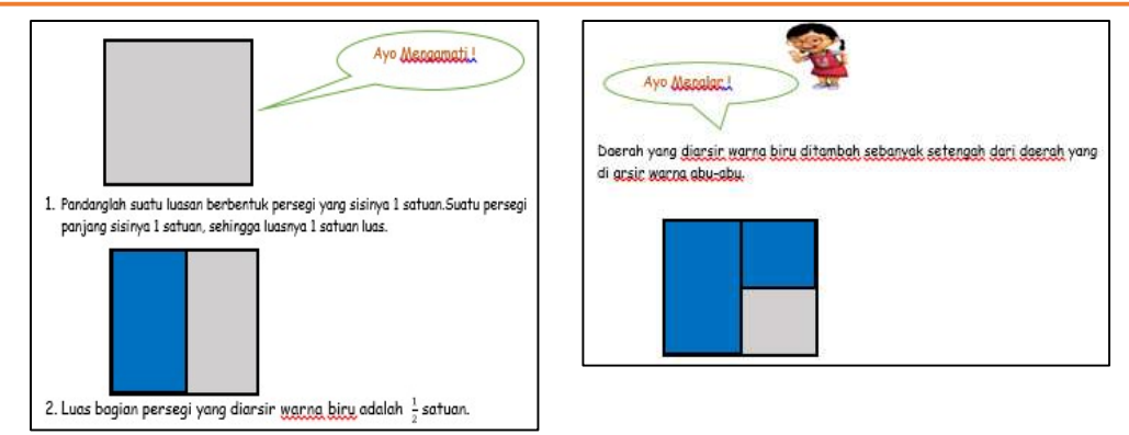
Figure 3. LKPD Activities Based on Guided Discovery

Kontinu: Jurnal Penelitian Didaktik Matematika E-ISSN 2656-5544 P-ISSN 2715-7326 Vol. 7, No. 1, Mei 2023 Hal. 1-18