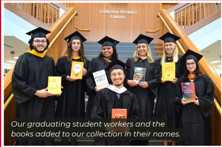
Our graduating student workers and the books added to our collection in their names.

Another summer full of new acquisitions, building improvements, orientations, and even a little bit of fun.