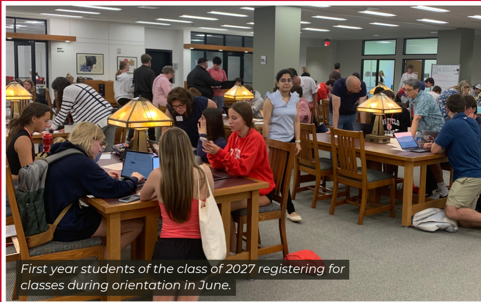
First year students of the class of 2027 registering for classes during orientation in June.