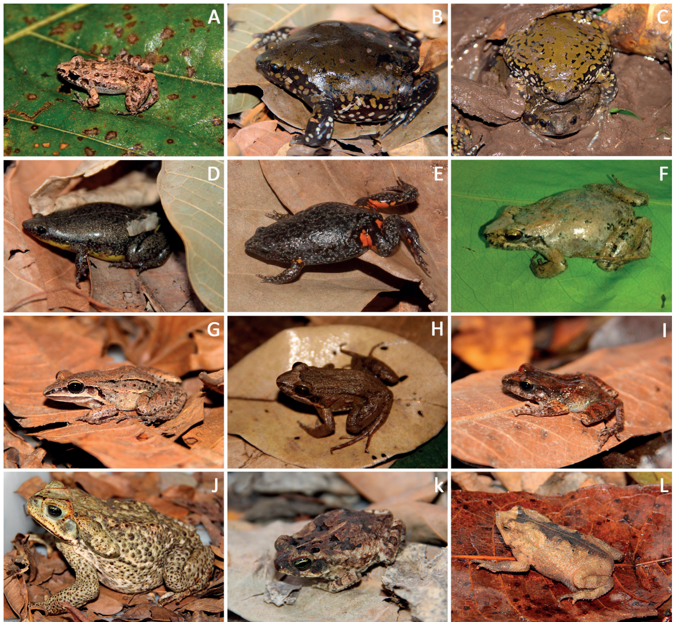
Figure 2. Some of the anurans registered in the fieldwork, municipality of Cáceres, Mato Grosso, Brazil. A = Adenomera cf. diptyx, B = Dermatonotus muelleri, C = D. muelleri in amplexus, D = Elachistocleis bicolor, E = E. corumbaensis, F = Leptodactylus cf. brevipes, G = L. elenae, H = L. podicipinus, I = Oreobates heterodactylus, J = Rhinella diptycha, K = R. diptycha young and L = R. scitula.