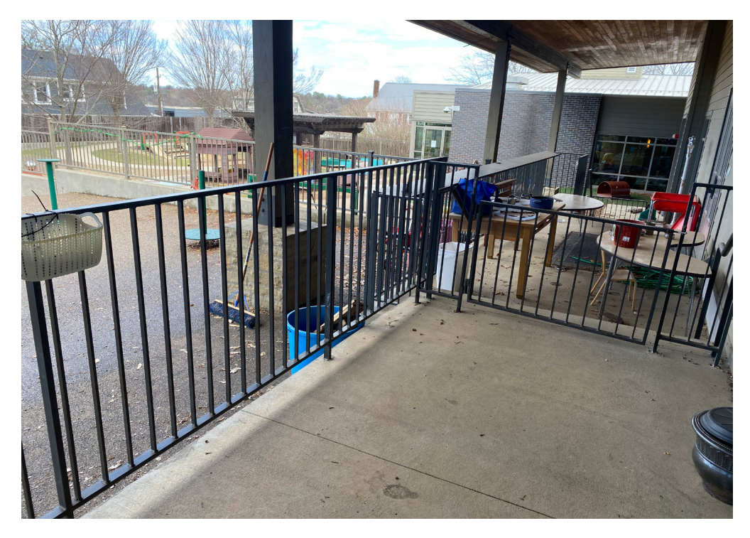
Fig. 1. View of the area of the University of Arkansas Jean Tyson Child Development Study Center before the installation of the art station.