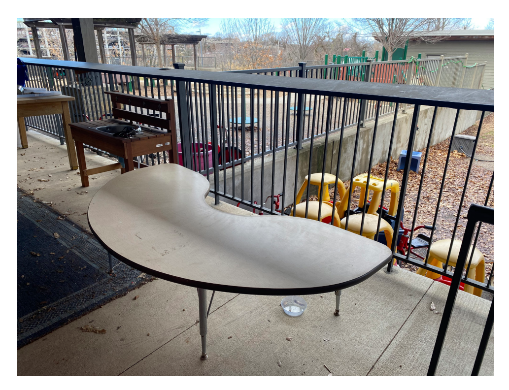
Fig. 3. View of the area of the University of Arkansas Jean Tyson Child Development Study Center before the installation of the music station.