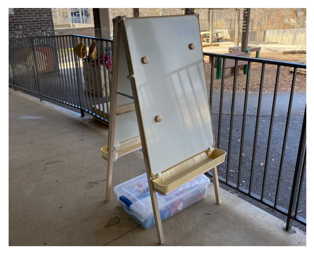
Fig. 2. View of the area of the University of Arkansas Jean Tyson Child Development Study Center after the installation of the art station.