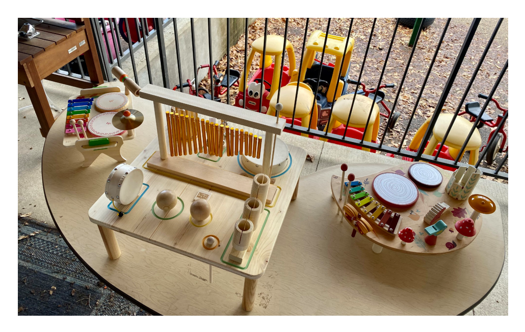
Fig. 4. View of the area of the University of Arkansas Jean Tyson Child Development Study Center after the installation of the music station.