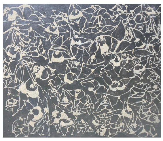
S. Kasaei. Oil on Canvas 100 x 120 cm