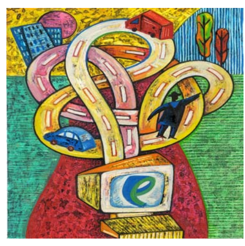
Jumbled Internet governance? There is no one international body that addresses all public policy areas affected by the Internet such as international commerce, intellectual property rights, economic development, and political issues. Some have proposed the creation of a global organization under the auspices of the United Nations to regulate the Internet.

or even the term "Internet" itself, and how much – or whether any – priority should be given to certain public policy issues affected by the Internet. Referring to the Internet, one academic study stated that its "governance is fragmented; no one organization dominates any of the issue areas, and there is almost no issue area in which only one organization is involved." There is also a growing debate on the control and regulation of the actual infrastructure underlying Internet itself.