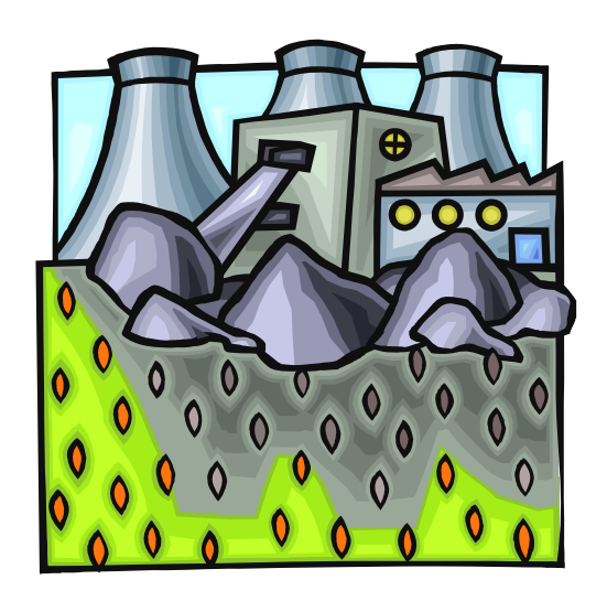
A weapons program draped in civilian clothing? One apparent loophole in the NPT treaty allows a country to pursue nuclear research — such as refining uranium — for peaceful purposes such as generating electricity. But one expert noted that "the technology for making low-enriched uranium for civilian reactors is nearly identical to that for making highly enriched uranium for atomic bombs."

Many government officials suspect Iran of using this tactic (even though that government continues to deny it). According to the Secretary General of the UN: "States that wish to exercise their undoubted right to develop and use nuclear energy for peaceful purposes must not insist that they can only do so by developing capacities that might be used to create nuclear weapons."