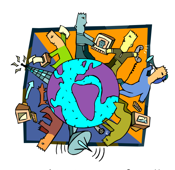
No consensus on Internet governance : Some critics say that further regulation of the Internet at the global level will be a very difficult political task. Not only do various countries disagree on a definition of the term "Internet governance," but a broad spectrum of groups — each handling different aspects of the Internet — has different and even contradictory priorities.

practices – has become a worldwide problem. One report estimated that over 70 percent of daily e-mail communication consists of spam, and that this percentage is expected to increase. Many policymakers and experts concede that current efforts to deal with this problem have proved woefully inadequate, and that the practice of spamming has clogged Internet traffic.