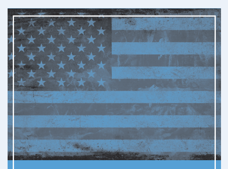
The 2011 Otto L. Walter Lecture February 15, 2011