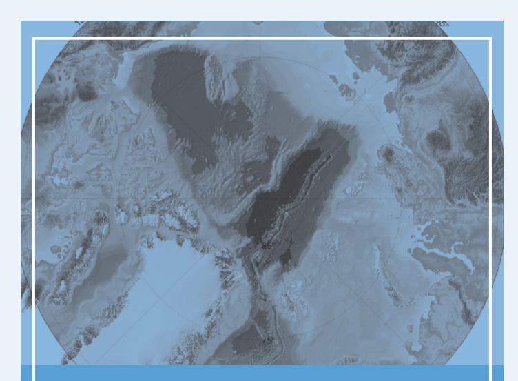
C.V. Starr Lecture April 28, 2011