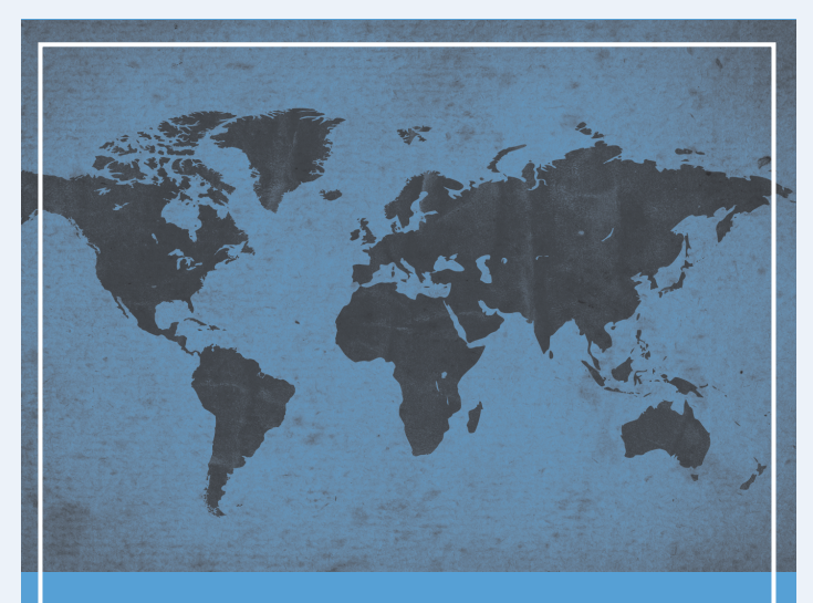
C.V. Starr Lecture April 4, 2011

Article 1 says that an individual, group, or even a state itself commits the "crime of mercenarism" if it "shelters, organizes, finances, assists, equips, trains, promotes, supports, or in any manner employs bands of mercenaries" specifically for the