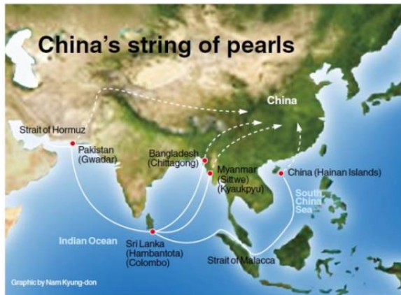
Map: "China's 'String of pearls' strategy to secure the ports of South Asia." Global Balita . http://globalbalita.com/?s=china+string+of+pearls .

influence and control is apparent in their recent port acquisitions. "China has either built or reportedly planned to construct vital facilities in Bangladesh, Cambodia, Maldives, Myanmar, Pakistan, Seychelles, Sri Lanka, and Thailand," 112 according to Patrick Mendis. These strategic port locations, known as "a string of pearls," are strategically positioned along trade routes leading from the Indian Ocean to the South China Sea. 113