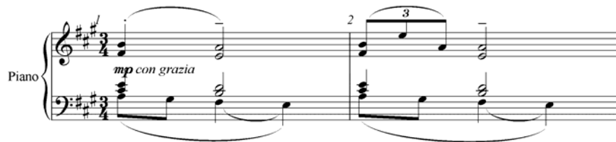
Example 16: Ireland’s Beckon to me to come , the ‘beckoning’ motif.

conclusion. Pilkington notes that this “beckoning” motif, which is used as a sort of ritornello, is that of a “fluttering handkerchief” 251 (Example 16).