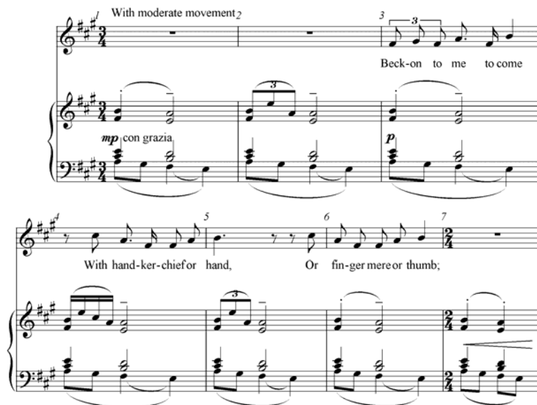
Example 17: Ireland’s Beckon to me to come : piano propels the piece forward in brief sections of rests in the vocal line.

Although the melody of Beckon to me appears to be in small sections separated by rests, its musical sections are sequenced together by a steady rise in the melodic line and via the rhythmic interest of its accompaniment. The piano propels the piece forward through its sections of rest in the vocal line. Ireland’s melodic lines, and likewise Hardy’s poetic interests, are sustained throughout several piano interludes in this fashion 252 (Example 17).