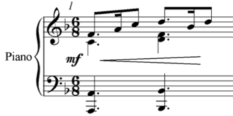
Example 7: Finzi's The Phantom . Reoccurring ascending motive ( idée fixe ) representing the gallop of a horse.

The motivic lines running throughout the left and right hands in The Phantom maintain their individual prominence because of their ability to “keep out of each other’s way.” 190 On the other hand, the scattered nature of their running about “guarantees the ‘quasi-symphonic effect’” 191 that defines one of Finzi’s greatest strengths. Characteristic of its contrapuntal nature, one can trace the melodic line within the accompaniment as its contour weaves from right hand, down to left hand and back up to the right. Finzi makes his intentions known in regard to the highly lyrical nature of the accompaniment by including markings such as legato pedaling (suggested by phrase markings) and lines drawn to show the movement of the melodic theme from bass to treble clef (Example 8 and Example 9). Finzi’s piano part paints a vast “landscape”.