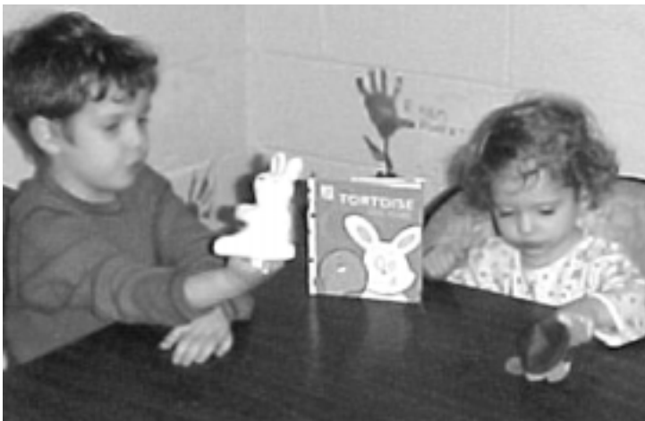
Figure 4. Young Children Enjoy Role-Playing with Puppets to Emphasize the Character Principle and Strengthen Comprehension of the Story

The teacher will read the story aloud so that everyone can experience involvement in the literature study, including younger students who are unable to read the books independently. The read-aloud technique can also be used for older students with poor reading ability. During the shared reading ex-