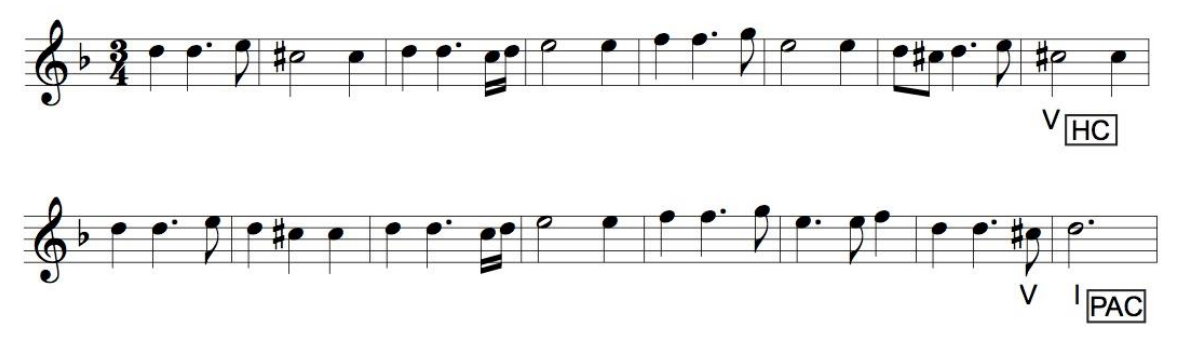
Figure 4. A. Corelli, arr. S. Suzuki, La Folia, mm. 1-16

performance. The excerpt from Corelli's La Folia (Figure 4) shows a simple parallel period with half (HC) and perfect authentic (PAC) cadences after each respective phrase.