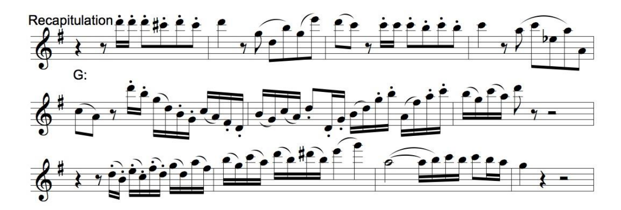
Figure 10. W. A. Mozart, Violin Concerto no 3 in G, Mvt 1 mm. 182-192 Sight Singing and Solfège

Building sight-singing skills is a sequential process. The first step is becoming familiar with scale degrees and/or Solfège. Before beginning work on a piece, the teacher can ask the student to sing the scale associated with the work. The student can then play the scale on his instrument and begin working on the piece. After becoming comfortable with singing scales, the student can begin singing sections of the piece's melody in Solfège. As the student becomes more fluent in the use of Solfège, the teacher can begin using it as a sight-singing tool. Students can sing through sections of new repertoire before even attempting it on their instruments.