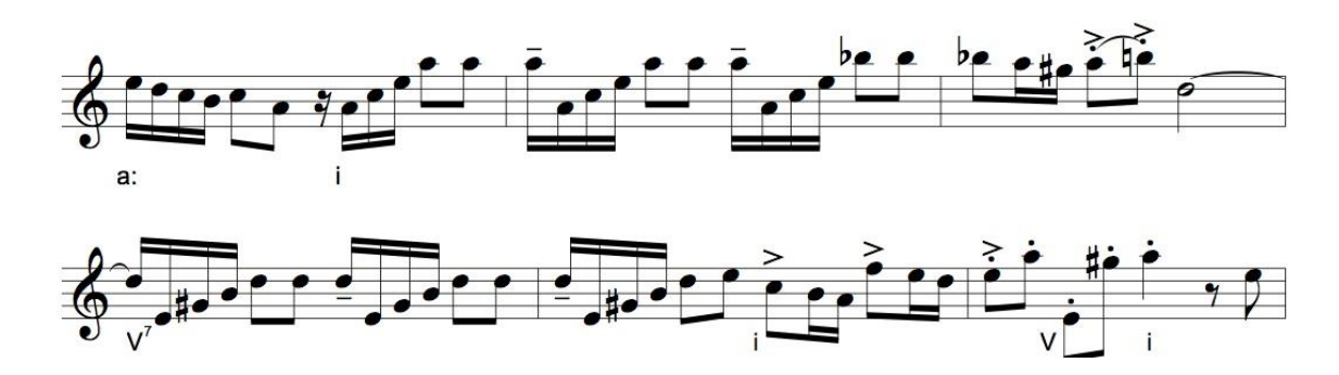
Figure 6. A. Vivaldi, Violin Concerto in A minor Op. 3 No. 6, Mvt. 1 mm 7-12

In Figure 6, further evidence of the tonality is given. Both tonic and dominant seventh chords (with the raised leading tone) are arpeggiated in this example. The E dominant seventh chord is entirely out of place in C Major. The G# would serve as a raised scale degree five, and the chord would be based on scale degree three. However, E<sup>7</sup> is expected in A minor and serves as the dominant chord. Using clues such as these will allow students to recognize modulations within a piece. Figures 7 and 8 are two excerpts from Veracini's Violin Sonata in D minor , Guige.