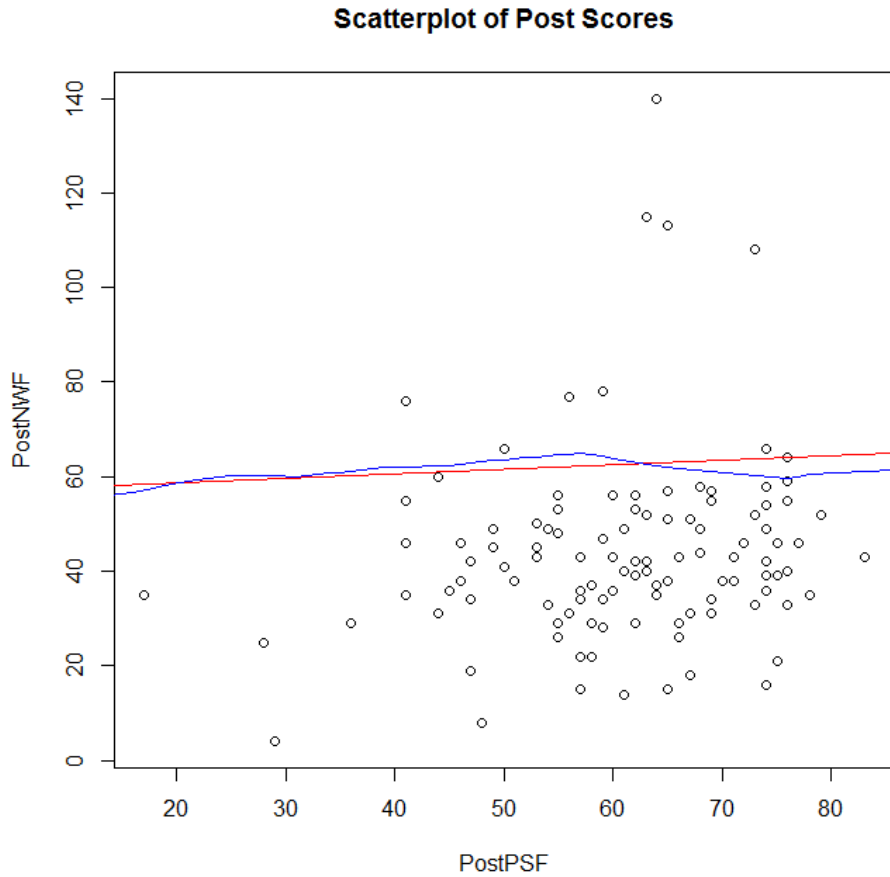
Figure 4.1. Scatterplot representing linearity without considering group (treatment or control) membership. PostNWF = posttest nonsense word (NWF) fluency scores. PostPSF = posttest phoneme segmentation fluency (PSF) scores.