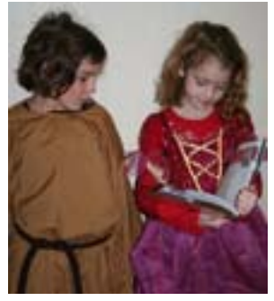
Figure 2. Barbary and Isobel

In both sample lessons, readers' theatre is the follow-up activity, selected to increase long-term effects on reading comprehension and genuine development of character. Readers' theatre does not require costumes, props, or memorization of the script, although minimal props can be used. As students rehearse the dramatic reading with partners, their oral reading fluency and comprehension is increased. Repeated reading and read-aloud are beneficial, especially for older students with poor reading ability. Role-playing is another aspect of the follow-up activity that demonstrates understanding of the character principle through the dialogue. Oral rehearsal aids in retention of the character lesson and increases the application of the character principle in real-life situations. The music score that is provided in the book for Alice's song, the shepherdess, offers another option for artistic expression in the follow-up activities.