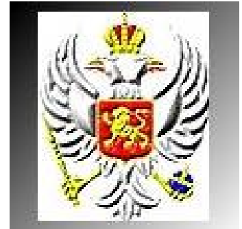
Montenegrin coat of arms

Djukanovic, the president of Montenegro since the 1997 elections and a former Prime Minister, is an aparatchik. However, since becoming president he has sharply criticized Milosevic for his confrontation with the West, and has enacted liberal reforms, launching a program of privatization, introducing the Deutsche Mark as the second currency in the country, and seeking cooperation with Montenegro's neighbors. During the NATO bombing campaign in 1999, Djukanovic blamed Milosevic for provoking the strikes but also called on NATO to stop the bombing. He repeatedly addressed the