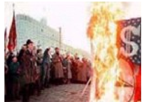
Anti-NATO demonstration in front of the Russian Parliament. April 1999

However, in spite of an ample anti-NATO campaign, Russian public opinion never favored at large military support for the rump Yugoslavia. If in October 1998, when 44% of Russian respondents in an opinion poll favored the action against 53%, then in April 1999, at the height of NATO strikes, only 36% were in favor, with 61% being against. And even if a larger percentage declared its readiness to go to fight as volunteers in Yugoslavia –67% against 27%–, there has been no confirmation of organized Russian military groups fighting on the Serbian side. 39 Nor could any Russian volunteer face a NATO pilot flying at 30,000 feet.