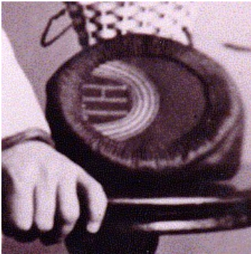
An enlargement of the picture showing the King's initials.

reminders of Montenegrin sovereignty were suppressed. Even the traditional Montenegrin hat which displayed the Cyrillic initials of King Nikola was banned and a new Serbian symbol was required to be worn atop formal hats.