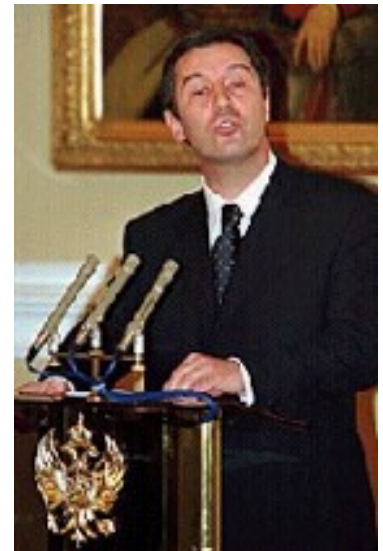
Milo Djukanovic, President of Montenegro