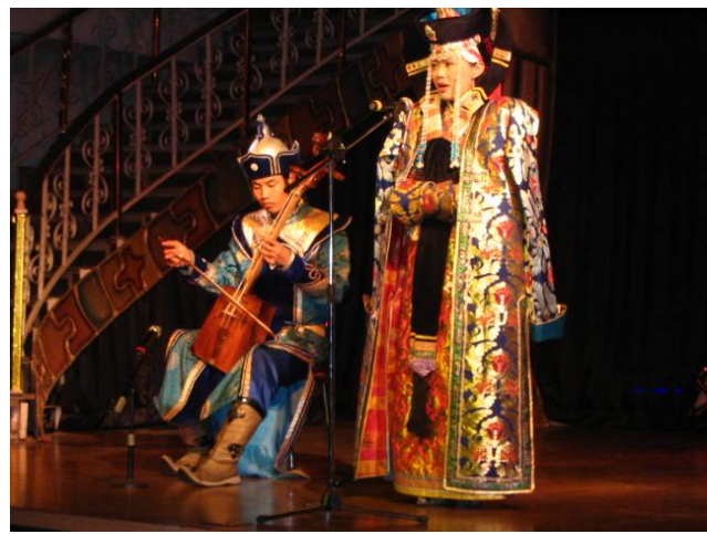
Fig. 11. Professional folk ensemble performance in Ulaanbaatar.