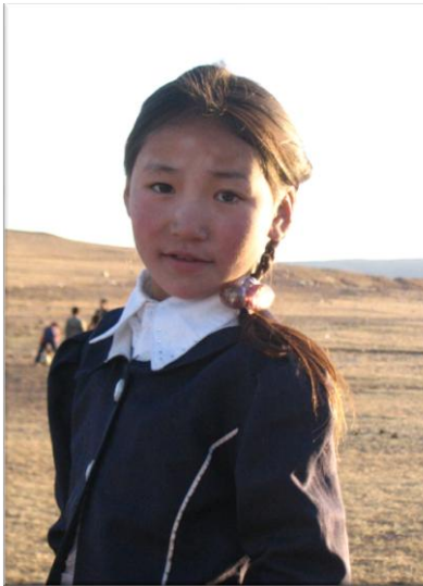
Fig. 1. Young Mongolian nomad.

Over the centuries, nomadic peoples have ingeniously adapted to the changing world around them. A strong social identity of independence and adaptability has enabled them to survive the storms of natural disaster, political upheaval, and technological power and still be standing after the storms have passed away. The nomads have learned to thrive in the world's most unlivable landscapes. Yet, despite their resourcefulness, society at