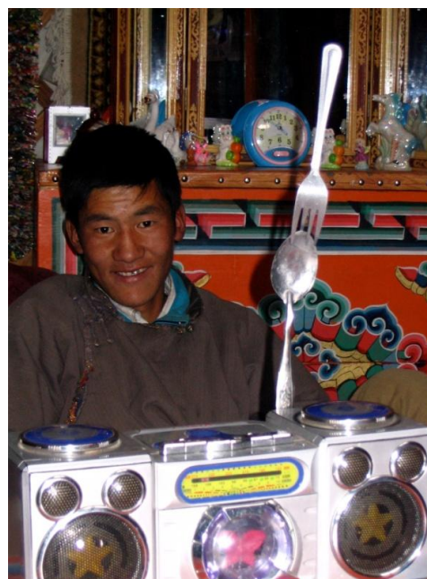
Fig. 14. Makeshift radio antenna.