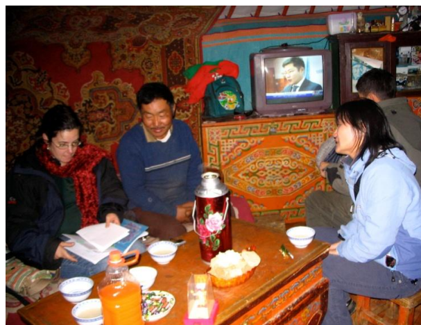
Fig. 9. Author interviewing rural veterinarian.

A third difficulty was the terminology and structuring of the questions themselves. Each of the five translators understood the questions differently and used different terminologies in both their Mongolian discussion and their English explanations to me. The interview questions went through multiple revisions over the course of the fieldwork in order to zero in on the words and questions which elicited the most response from the participants. However, no matter how vague the answers I received were, the revisions had to be limited in order to keep some continuity for the sake of comparing and contrasting the answers across regions and family groups. I've included, below, the starting set of interview questions which I drafted during the proposal stage of research, followed by the final version of questions after working through several revisions on the field. Over time, the questions addressing abstract ways