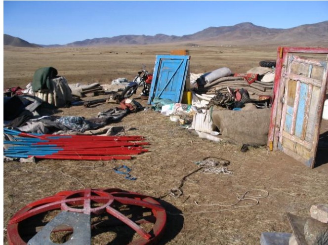
Fig. 4. Herding camp dismantled for a seasonal move.

distinct but interrelated categories. This transition came in part by a progression of thought that changed from viewing nomads as separatists, unaffected by society at large, to a more diversified view where a continuum of intersection between nomads and sedentary societies exists. For example, various stages of