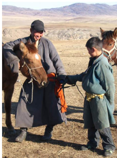
Fig. 12. Herdsmen brothers

Learning from parents and relatives in the home was actually prohibited by the MPRP during the Socialist era. “Performers of traditional Mongolian music, dance, and song were said to be part of an ‘illicit continuation of feudal traditions’ (Bawden 1989:377), and even within the home, such performances were forbidden. Traditional instruments, vocal and instrumental styles, and contents were all affected. The aim of the process was to ‘neutralize’ ( saarmagjih ) the traditions” (Pegg 2001, 256). It is possible that the influence of this initiative curtailed the popularity of traditional education methods and performances. While there were only a few herders who considered themselves