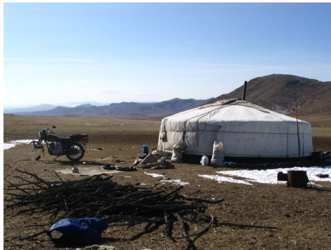
Fig. 2. Typical Mongolian nomad's home.

There are many obstacles to sharing Christ with nomadic peoples. One is the lack of individuals willing to live alongside them, endure the same hardships, and see little immediate influence. Other obstacles include distance of travel from one family group to another, the mobility of these family groups, the finances and investment to locate the families every season, the lack of fellowship and discipleship materials for those that do become Believers, and the peer pressure that these Believers face in the midst of this lack.