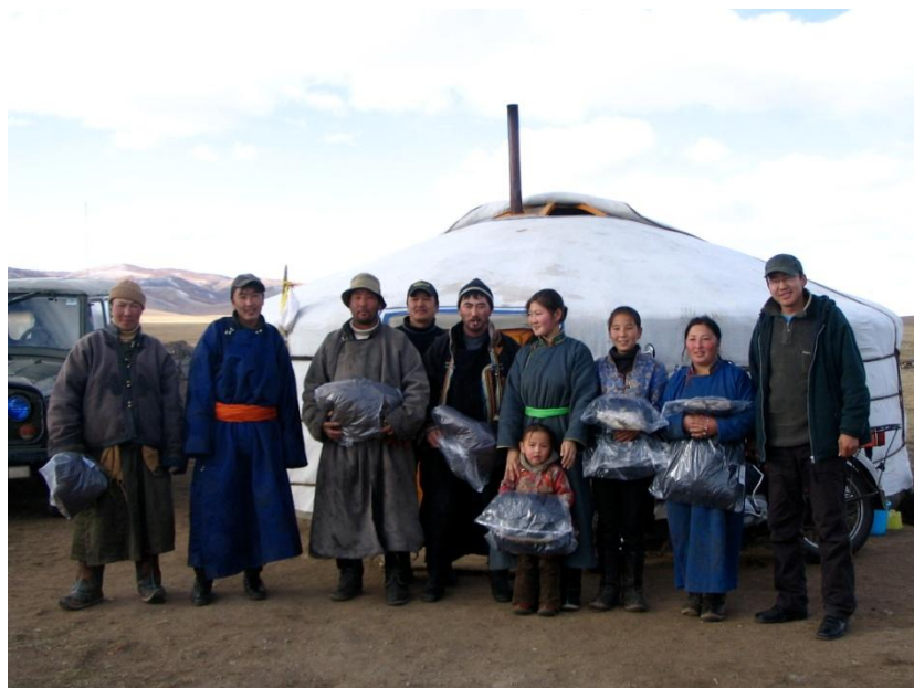
Fig. 6. Mongolian kinship group.