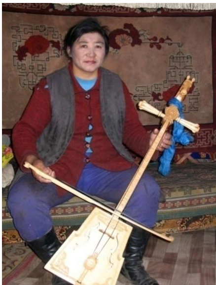
Fig. 10. Rural herding woman's performance.

The rural music culture comes into greater focus when contrasted with the urban culture for there is a significant difference. Even if some of the same styles are enjoyed, the context surrounding their performance is different. In the city, the traditional music culture is seen as irrelevant to daily life except during special holidays like Naadam (Festival of the Three Manly Sports) or the New Year ( Tsagaan Sar ). But in the countryside, it is a daily negotiation and confirmation of who they are in a shifting and what is perceived as declining environment. In my observation, there is a need to identify with the past and to give oneself a sense of belonging, pride, and stability.