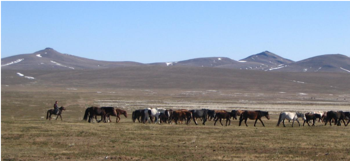
Fig. 16. Nomad with his herd.

to live there and proud of the things that come from the land. “This is the real herder’s life” was a common phrase. In my observation, there is a distinction between the verbal discourse of an ideal life and the reality of the hardships and negotiations they face. But it is in those moments of communal sharing and singing that things are put back in order. During a celebration, ‘things are as they should be.’ 13 Regardless of the variances of details, one overarching response that was in the discourse of every participant was the identity of countryside people as a music loving and music making group who connect on a heart level with song of the countryside. It is hard to say what is real and what is imagined, as every family had a slightly different experience. But whether the instruments or musicians actually exist in a given context or they exist in verbal description only, traditional music originates from the countryside, is a medium of social negotiation with people and nature, and sets things in order. It is who they are. The morin huur is their instrument and the ardyn duu is their anthem (even if they rarely see a morin huur performed live or personally prefer written songs over the national song.)