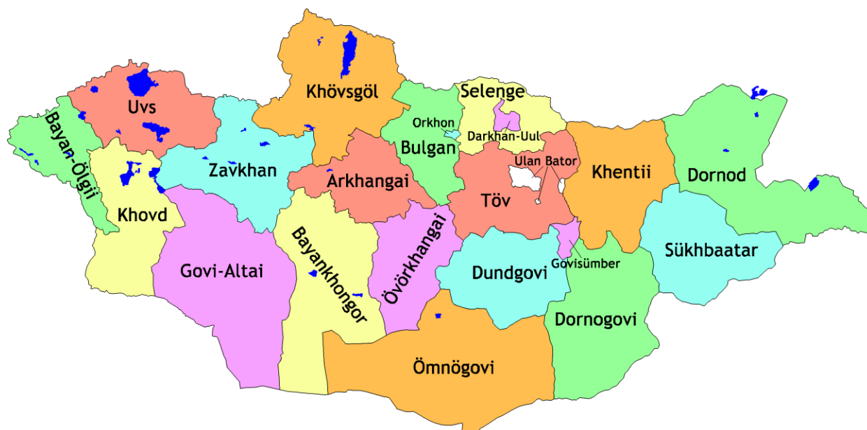
Fig. 8. Provincial map of Outer Mongolia

Including Töv province, the home of Ulaanbaatar, these four locations provide a survey of central Mongolia.