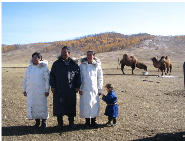
Fig. 3. Camel herders in Central Mongolia wearing new coats provided by local ministry.

The scope of this study is confined to interviewing and observing multiple Mongolian families within extended driving distance from an urban area into three different rural political districts. The research takes place over multiple two week trips over a four year period rather than one extended stay with one family group. Because the goal of the research was to gain a general sense of popular musical tastes within the rural regions of the country, I chose to focus more on a survey approach interviewing multiple families across a range of contexts. This provided a limitation in that I was not able to spend extended time in observing life cycle events, festivals, and other opportunities of performance within the daily lives of individuals.