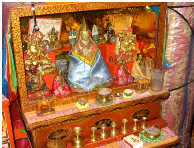
Fig. 15. Example of elaborate Buddhist shrine.

observations of central Mongolia, I saw one in four families who had elaborate shrines and/or performed ritual offerings to the Buddhist idols or local deities, one in four families who had only family pictures and their nicest things where the shrine would go, and the rest were somewhere in between with a mixture of Buddhist statues, pictures