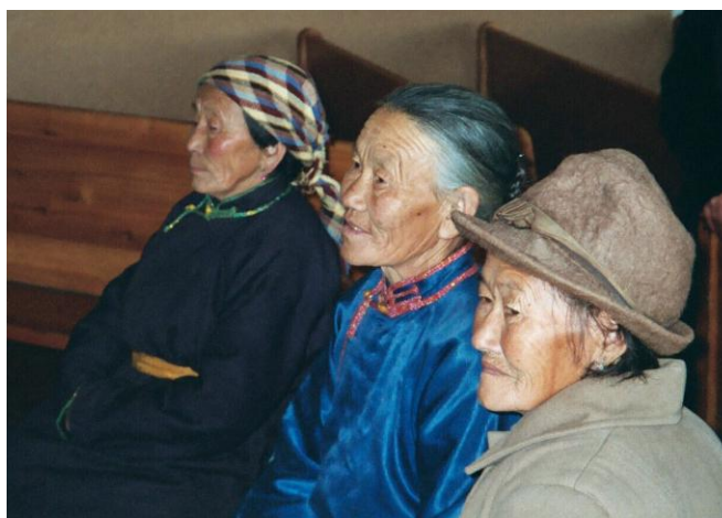
Fig. 7. Elderly women from Ulaanbaatar.

My first set of interviews took place in the capital city of Mongolia, Ulaanbaatar in 2003. I was comparing and contrasting the likes and dislikes of various styles of music from hip-hop to Buddhist chants to Christian worship to