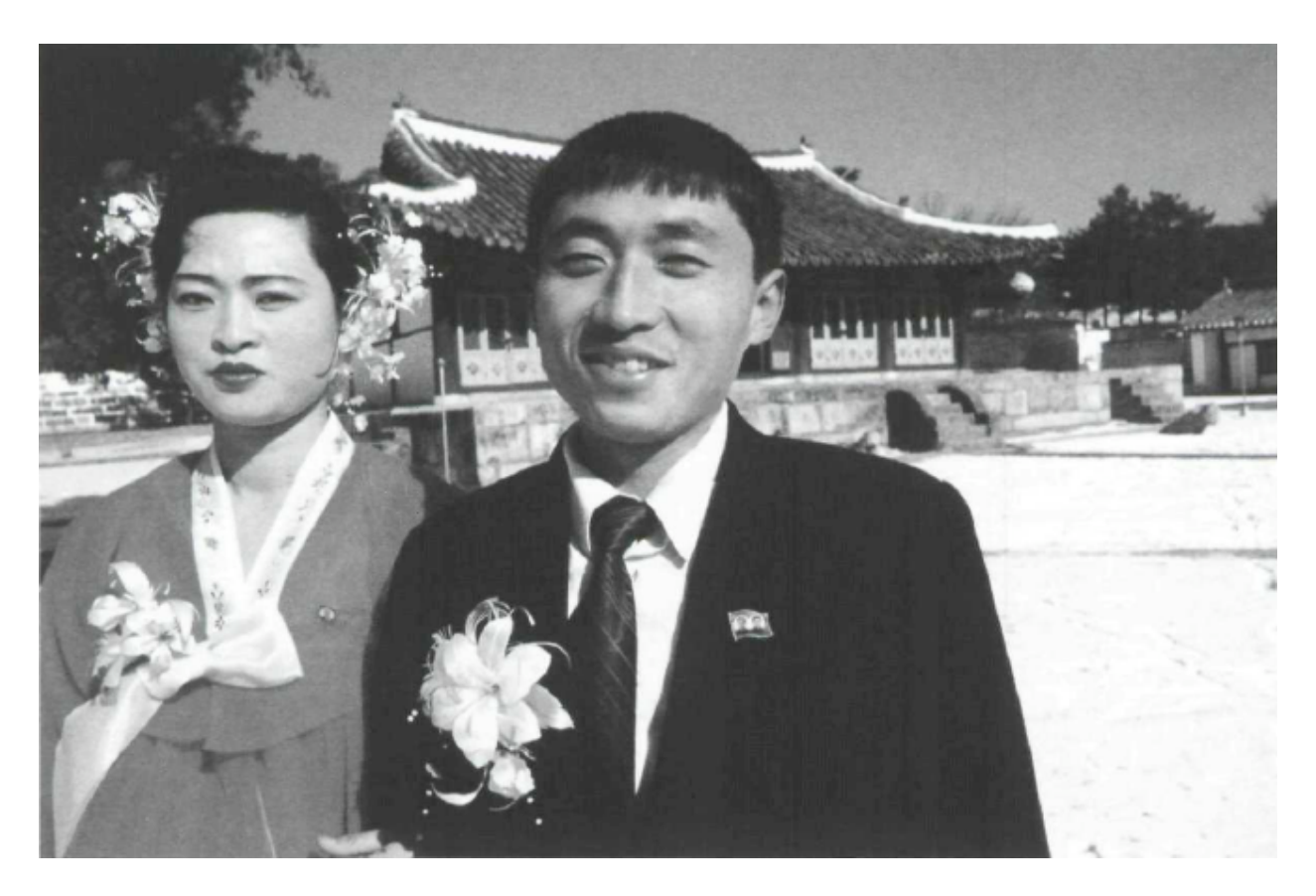
Figure 2. A couple wear badges of Kim Il Sung on their clothing on their wedding day. from Tatlow, Dermot. "Taking Photographs in North Korea." <u>Nieman</u> <u>Reports.</u> 2004.