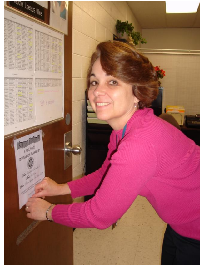
The licensure and field experience office!