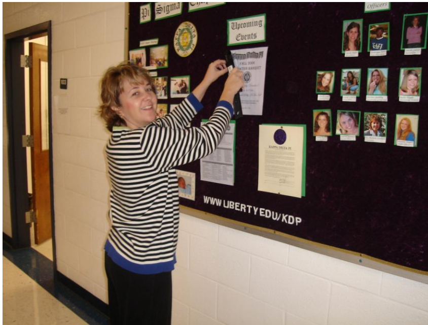
The KDP Bulletin Board