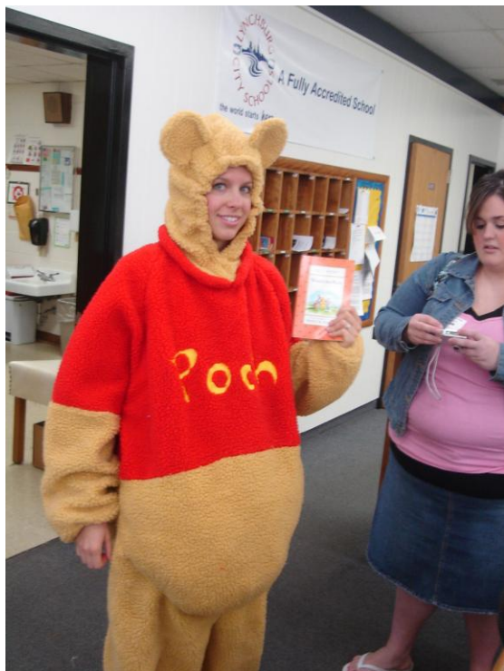
Winnie the Pooh