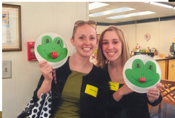
Frog & Toad are Friends! 😊