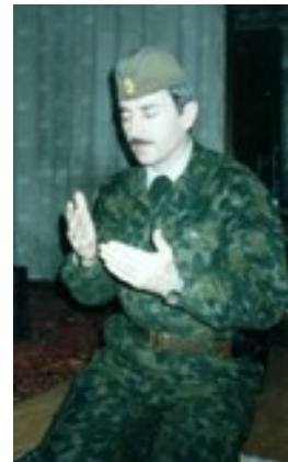
Former Chechen President Jhokhar Dudaev performing a religious ritual