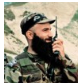
General Shamil Basaev