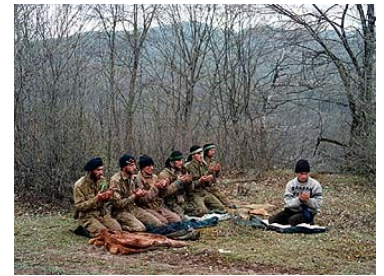
Chechen soldiers in prayer

In this environment, it is not surprising that almost all sects have armed formations, generally described as militias, which work to advance the often-divergent interests of their particular brotherhoods. A very