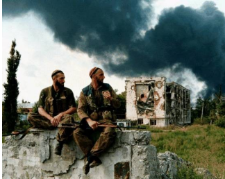
Chechen soldiers resting after combat