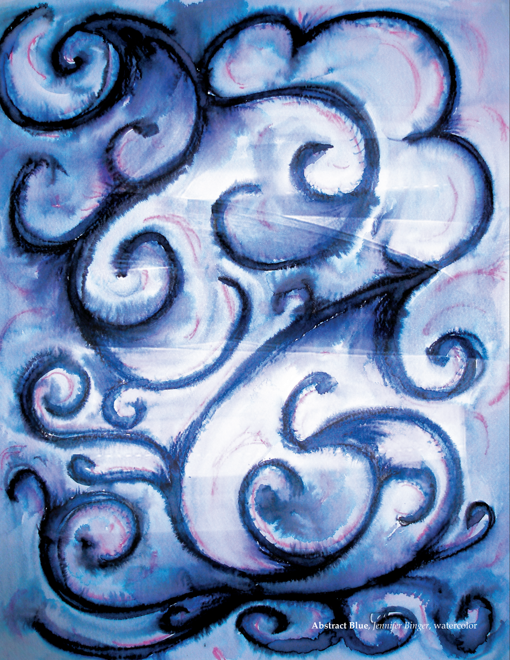
Abstract Blue, Jennifer Binger, watercolor