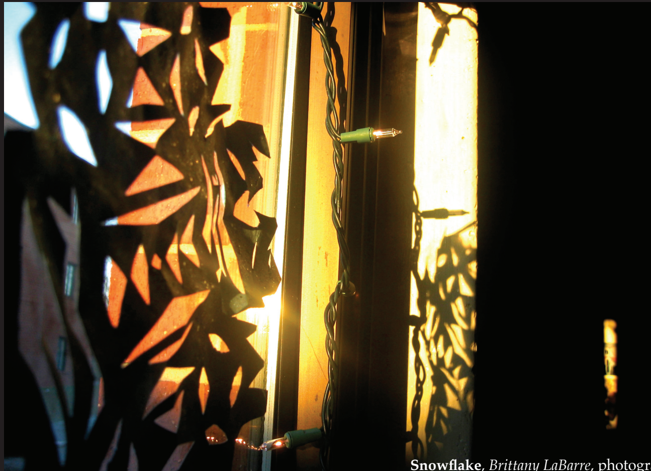
Snowflake, Brittany LaBarre, photography