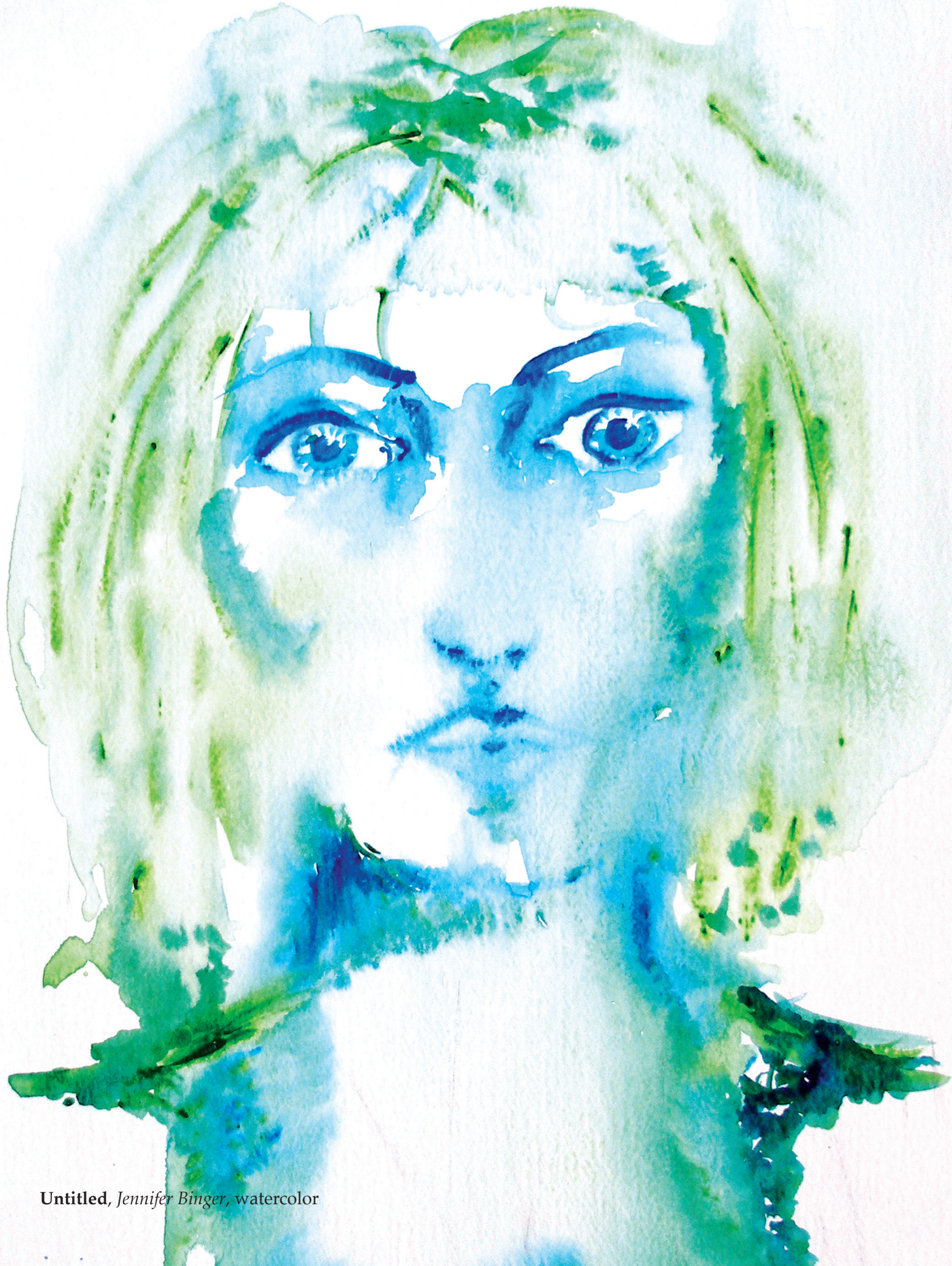
Untitled, Jennifer Binger, watercolor