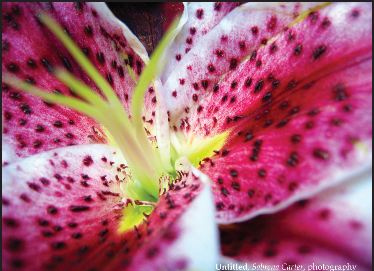
Untitled, Sabrena Carter, photography