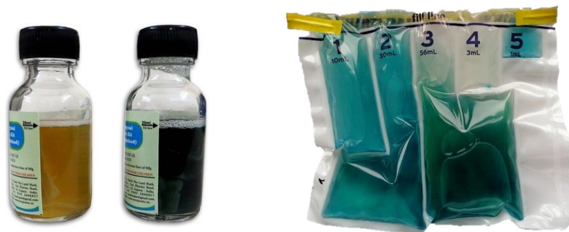
Figure 1. (Left) Hydrogen sulfide ( H_2S ) method. Field-testing vials manufactured and marketed by Water Health Laboratories under contract with UNICEF (IndiaMART Web). Yellow vessel indicates a negative result, while black vessel indicates a positive result. (Right) Aquagenx ® Compartment Bag Test (CBT) for MPN. Pale yellow compartment indicates negative result, blue-green compartment indicates positive result for E. coli , and compartments that fluoresce blue under 365 nm UV light indicates positive for total coliforms.