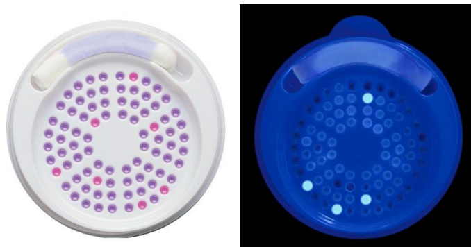
Figure 3. SimPlate ® system: (left) pink wells indicate a positive result for total coliforms (Merck KGaA Web); (right) fluorescence in wells indicate a positive result for E. coli (Agrinea Web).