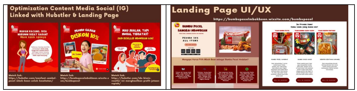
Fig.5 Promote Content

From the content that has been published through the <u>www.hubstler.com website</u>, then content material is made that can also be accessed through Sambel Pecel Mbok Bean's social media and also on the <u>https://bumbupecelmbokbean.wixsite.com/bumbupecel</u> website. This provides an opportunity for more users to find out Sambel Pecel Mbok Bean information through search sites.