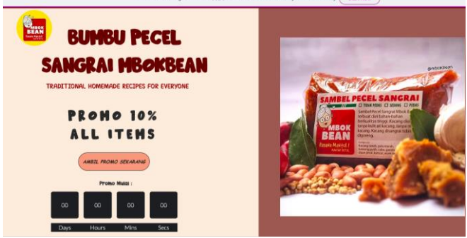
Fig. 3 Website for Landing Page

The Website also have interactive User Interface and User Experience so the user that visit in the website can stay longer and it can improve the time of their visit in the website. The website also have hyperlink with E-Commerce and Social Media that Sambel Pecel Mbok Bean have so if the user visit the website, they can also click the link that will be connected to Social Media and E-Commerce.