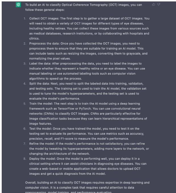
Figure 2. Generated from ChatGPT from the text prompt “how can I build an AI to classify OCTs.”

We then asked ChatGPT to code an AI to classify mammography scans (Figure 3).