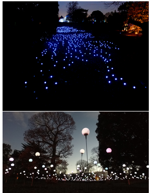
Figure 1: Bloom installed at Kew Gardens, London.

In this paper we report on the creation of a system made up of nearly 1000 distributed pixels all of which included audio capability and hardware, and which were connected together on a wireless