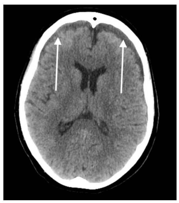
Image 3. Computed tomography of the head demonstrating right and left subdural hematomas (arrows).

six hours. The following day, the patient's repeat CT head without contrast showed new bilateral subdural hematomas measuring eight millimeters (mm) on the frontal aspect on the right and seven mm on the left, and SAH in the left parietal lobe [Image 3].