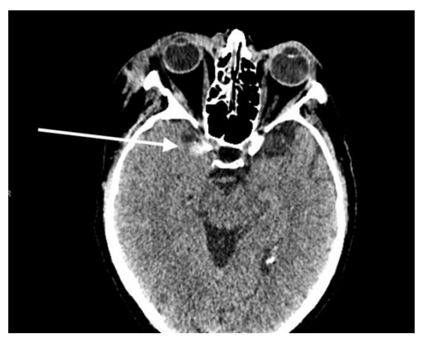
Image 2. Computer tomography of the head demonstrating foci of subarachnoid hemorrhage (arrow).