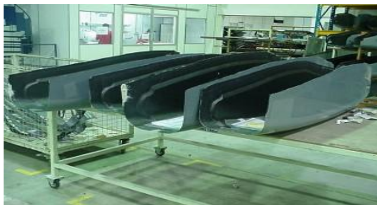
Figure 1.1: A composite panel

This study involves two companies that produce aircraft components or panels made from composite materials, as shown in Figure 1.1. All these components are made from high quality, lightweight and strong Composite Fibre Reinforced Panel (CFRP) composites to accommodate the loads and pressures that exist on the aircraft. Two companies were chosen for this study, Company A and Company B because they have a composite trimming or cutting process, which are considered to be quite complicated, high-risk and thought work processes. Therefore, only five workers with enough skill and experience should be selected to do the job to ensure the quality of the product since each composite panel is quite expensive and sensitive (NIS, 2019).