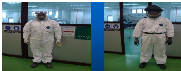
Figure 1.2: Workers in PPE suit

By wearing those PPE suits, the workers may feel uncomfortable and hot as they are in the suit for 20 to 25 minutes. In addition, the air circulation in the cutting room should be in good condition to reduce heat as well as in open area. Therefore, while they are working, they also need to deal with the uncomfortable condition of wearing PPE, in standing position while doing the cutting process, a noise coming out from the cutting process and the vibration absorb from a hand tool. Hence, this condition has become a justification point for this study to be carried out as it concerns the body posture, hand tools and working environment in the context of ergonomic risk factors.