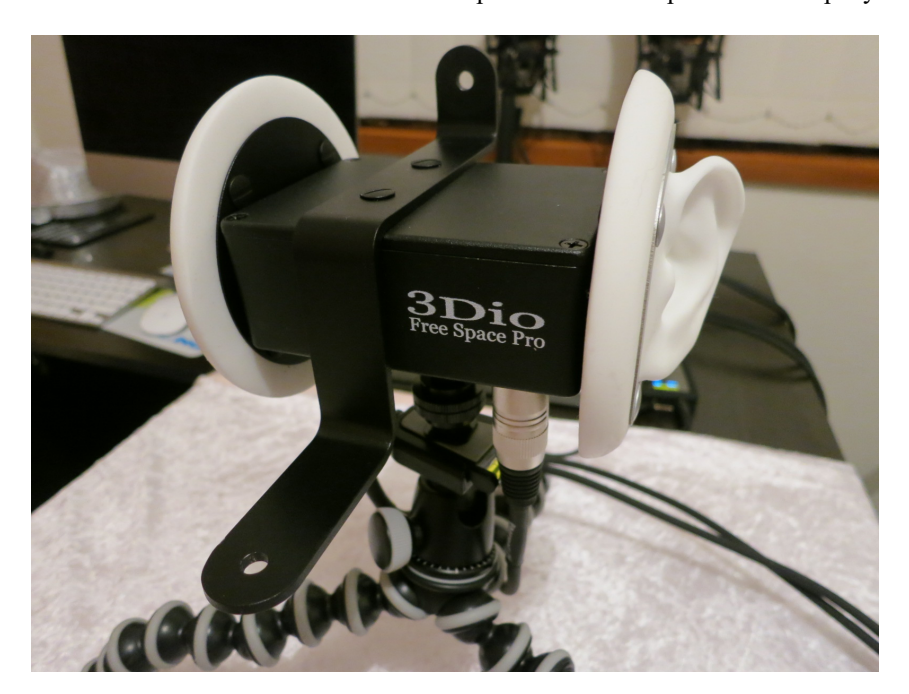
Fig. 2. 3Dio's Free Space© device.

The method of recording binaural sound uses two microphones in a mock head with two ear-shaped pinnae, simulating the ear's natural position, creating an ear spacing or "head shadow" from the head to the ears. In fact, the student perceives Interaural Time Differences (ITDs) and Interaural Level Differences (ILDs). Adjustments (known as Head-Related Transfer Functions (HRTFs) are done automatically by the system itself. That means that sound is sequenced naturally as sound "involves" the human head and is adapted to the form of the outer and inner ear. The most often used commercial device is 3Dio Space Pro© developed 3Dio Company.