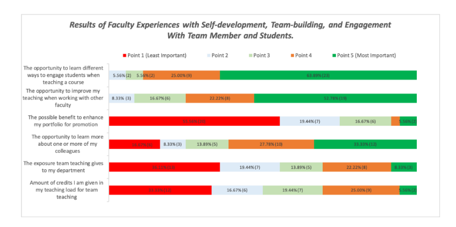
Figure 2. Results of Faculty Experiences with Self-development, Team-building, and Engagement with Team Member and Students

The last set of questions was associated with participants' experiences and the crucial areas related to team teaching. The majority of the participants strongly agreed with the following variables: 1) We shared in the responsibilities to set the overall goals or objectives of the course? Clearly communicated in our lesson planning 2) We were both involved in establishing the assessments for the course 3) We were both involved in establishing the learner activities for the course 4) I found the faculty member(s) with whom I was team teaching to be flexible in making decisions and presenting our course to students. 5) We listened to each other's ideas for planning learner activities 6) We know how to utilize each other's strengths in the teaching/learning process 7) We worked together to set classroom management expectations for the course and put in equal efforts and 8) I am satisfied with the amount of class time I was given in team teaching. Whereas, participants did not agree with following three factors as strongly: 1) In team teaching, we got to know our students better than when teaching individually 2) We shared the responsibilities of reviewing and grading the work submitted by our students in the course and 3) We were both involved in establishing the rubrics for the assessments used in the course, see Figure 3 for a graphical representation.