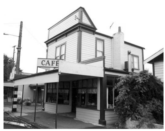
Figure 1: Two storey premises with retail or commercial facilities on the ground floor with residential above

the regular flooding of the Waiohine river. Greytown became a borough in 1878 but stopped growing when the railway by-passed it.