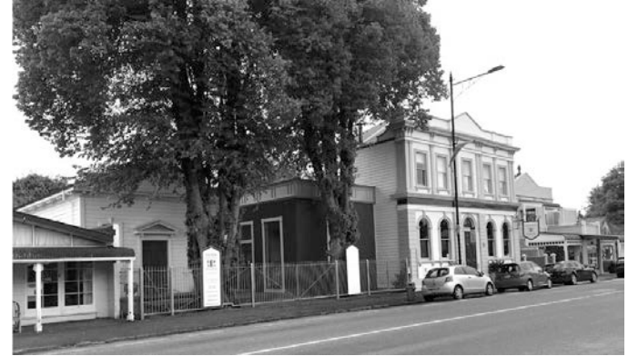
Figure 2: Greytown Town Hall (left), Emporos (former bank of New Zealand) (right).