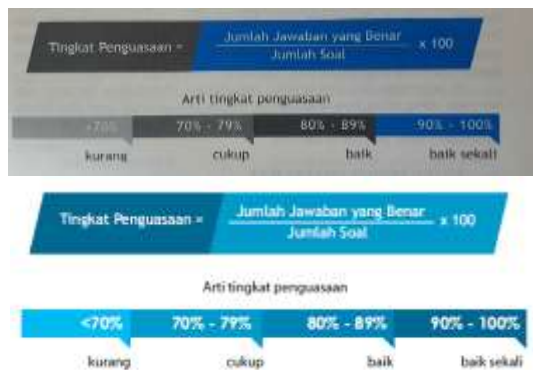
Figure 2. Comparison of feedback layouts using two-color separation