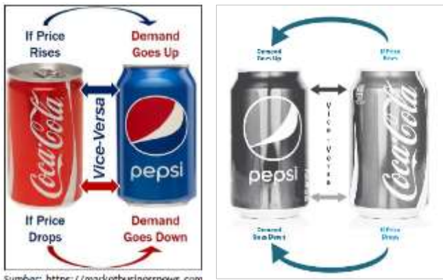
Figure 1. Full color image becomes two-color separation

combination will be further composited to create derivative colors. The colors will be tested through printing and using various printing techniques, starting from light to dark shades.