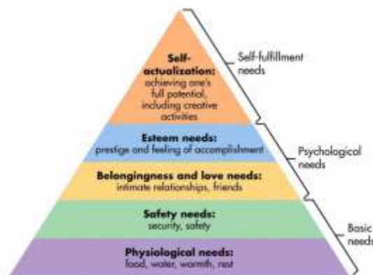
Figure 1: Maslow's Needs Hierarchy Pyramid

According to Lee, K (2020), stressed or anxious children frequently exhibit physical or behavioural changes. According to their age, unique personalities, and coping mechanisms, children react to stress differently, leading many parents to ignore the underlying problems influencing their child's behaviour. Children cannot frequently express their genuine or imagined stressful circumstances, making it difficult to understand their anxiety. Parents may be unclear as to whether various physical and behavioural symptoms are indications of anxiety or a medical issue resulting from this. There is a feeling of well-being among children. However, lifestyle choices and future health behaviours are being formed at this impressionable age. Recent surveys of young people's health behaviour in Europe, Canada, and the USA have revealed alarming information regarding health risk behaviour. Due to an imbalance between the requirements placed on an individual and his or her inner and exterior resources to meet those demands, stress poses a risk to health in today's society.