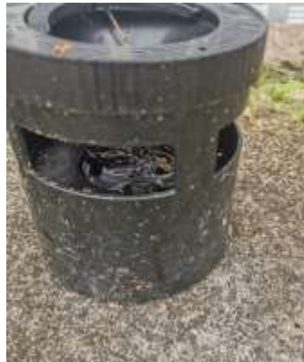
Fig 2: Ovitrap for larvae collection

This stage will involve collecting wild strains of Aedes mosquito species using ovitrap devices (Fig. 2) (Arévalo-Cortés et al., 2022; Awang & Che Dom, 2020; Teo et al., 2017) placed in the selected locality in the city for microclimate measurements. Ovitrap will be placed in all 30 sampling points selected before the microclimate measurements. The type of breeding water and container will be standardized to prevent bias in the study. Larvae of Aedes mosquitoes collected from the field will be bred in the laboratory as part of the preparation for experimental study in the laboratory setting. The ovitrap used are black plastic containers containing an oviposition paddle filled with tap water at 5 to 6 cm in height, which will be placed in shaded and unshaded areas (Teo et al., 2017). During the research, ovitrap placed in the field will be collected after day four before being replaced with fresh ovitrap for subsequent collection (Teo et al., 2017). Collected larvae will be brought to the laboratory for identification and rearing for the experimental phase of the study.