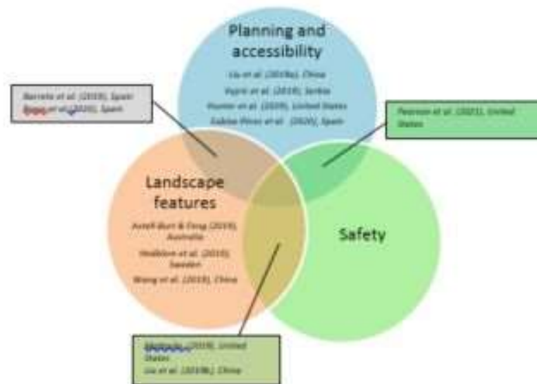
Fig. 3: Open green space elements for positive mental health

Table 1 presents the main findings of the included studies. Three of the 12 articles were piloted in the United States, followed by Spain (n = 3) and China (n = 3). The remaining studies were conducted in Australia, Sweden and Serbia (n = 1). The classified key elements in providing the findings are modified into three key aspects: planning and accessibility, landscape features, and safety to keep positive mental health. Particular articles have one or more key aspects of the open green space elements for positive mental health, as shown in Fig 3.