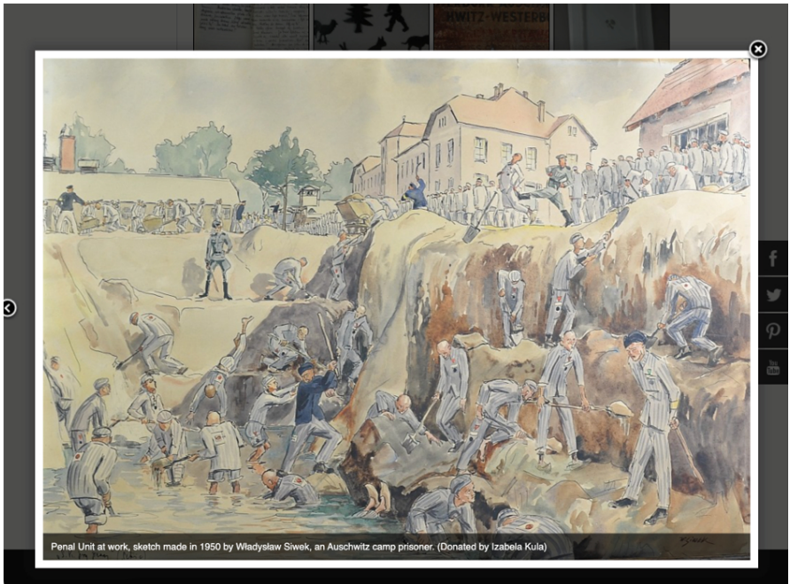
Figure 1: Screenshot of the presentation of a painting by Władysław Siwek in the exhibition Let us build a memory by the Auschwitz Birkenau State Museum, first indexed in 2016; https://www.auschwitz.org/en/visiting/on-line-exhibitions/let-us-build-a-memory/ .

and beating the gender-less, but feminised, hunched members of a penal unit. 2